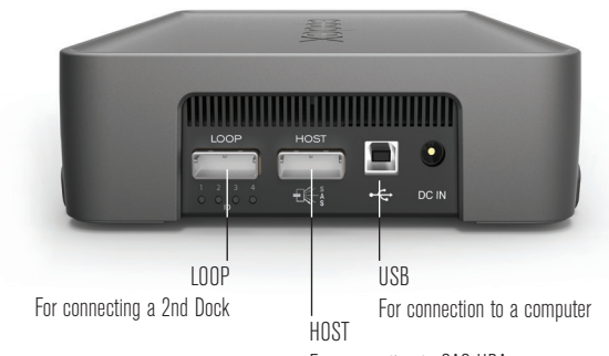
For connection to SAS HBA

With the ATTO card installed connect the Dock using the supplied SAS and USB cables (both must be connected). The SAS cable should connect from the HOST port on the Dock to the SAS HBA. Then connect the Dock to the included power supply unit. Only the included power supply should be used. A reliable power source should be used because losing power to a Capture Drive whilst it is reading/writing may compromise data integrity.